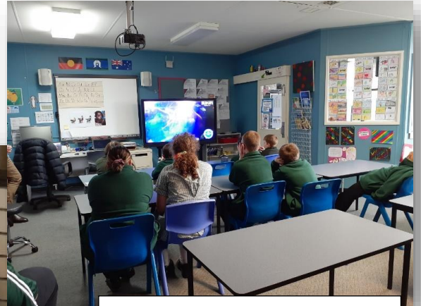
Students enjoyed a virtual tour of the Melbourne aquarium