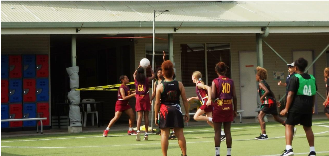
All eyes are on the ball as a LIS player attempts to shoot a goal.

The LIS 2022 Netball carnival proved to be a fun-filled event of friendly rivalry between Lihir International School (LIS) and visiting teams from Our Lady of Sacred Heart (OLSH) school in Kavieng.