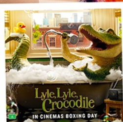
Lyle, Lyle, Crocodile