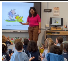
Above: Explicit teaching of segmenting the phonemes of spoken words using the focus phonemes for the day.