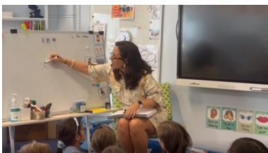
Above: Explicit teaching of identifying the beginning phoneme in spoken words.

Here is an example of how this has looked in one of the Kindergarten classrooms this week.