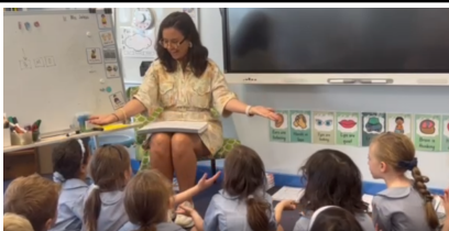
Above: Explicit teaching of separating the two parts of spoken compound words.