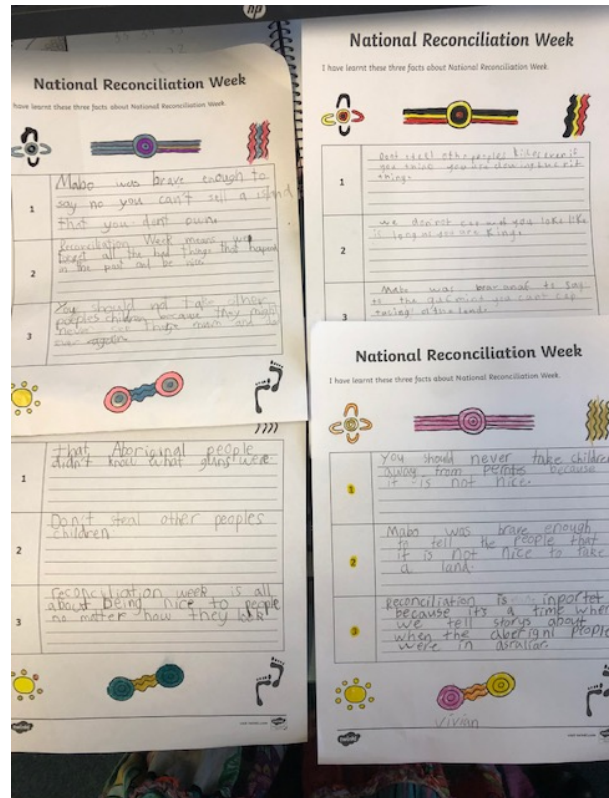
1/2K beneath our two flag poles and some of our responses to Reconciliation Week

Things I learnt about Reconciliation Week: