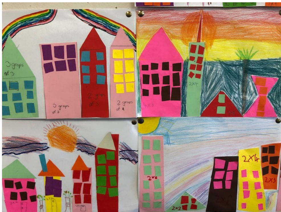
4 completed Array Towns