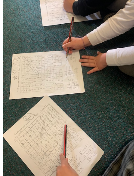
And numbers close up!!