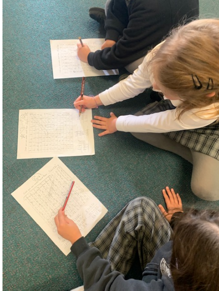
Let's find those numbers!

1M are just crazy about numbers this week! They even made a number find-a-word each and then gave it to a friend – who had to find all the hidden numbers. Some of the numbers were 7-digits long!! WOW!!