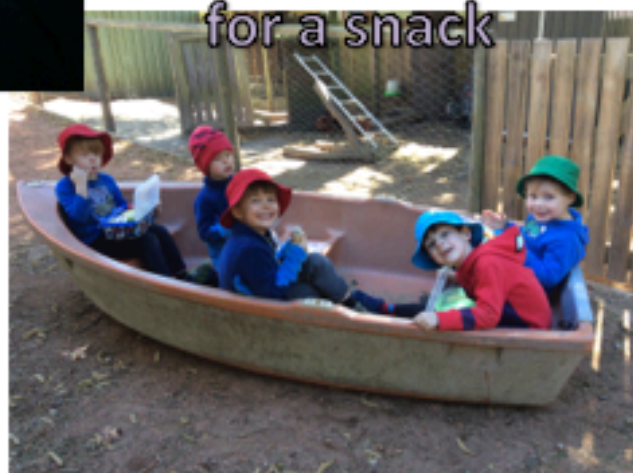
Superheros stopping for a snack