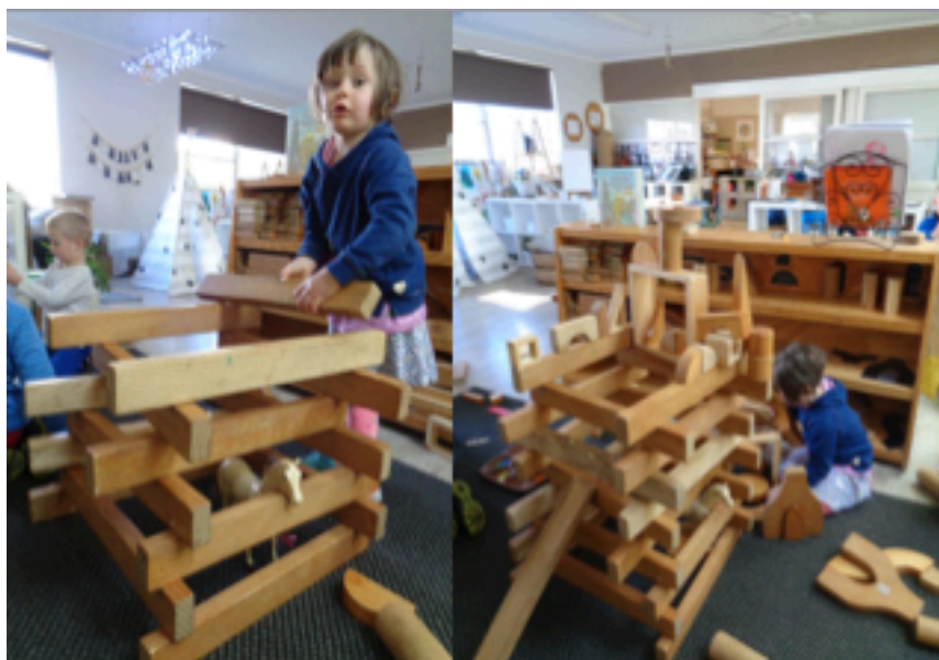
A horse stable