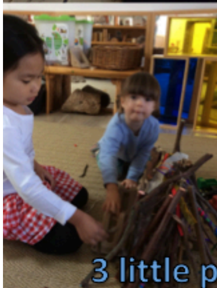
3 little pigs house