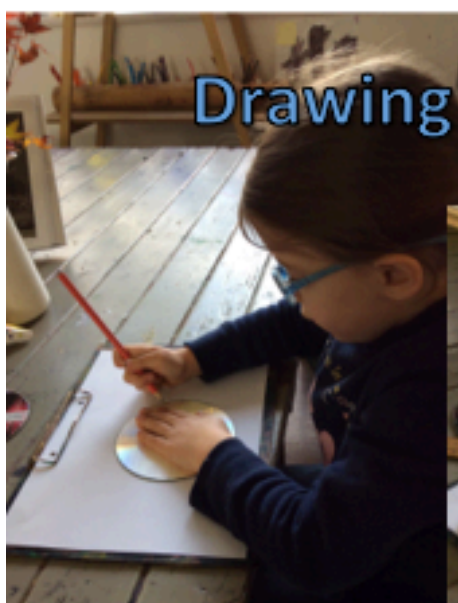
Drawing using shapes